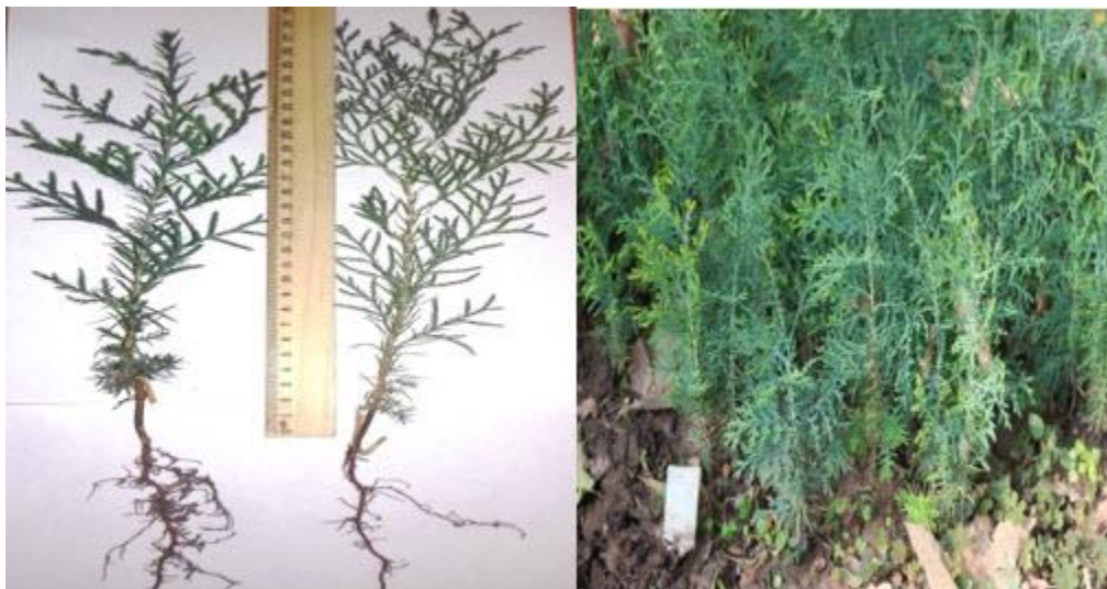
Figure 3. Biota compacta of the first year of the growing season (September, 2018), b - a general view of the experimental plot

The second year of the growing season began with the first decade of March. At this time, the average air temperature was 13.8 °C, relative humidity of air - 60-65%, illumination - 9000 lux. Plants start growing season from mid-April. Intensive growth occurs in May-June, reaching a height of 20-26 cm, while the average air temperature was 21-26.7 °C, relative humidity -%.