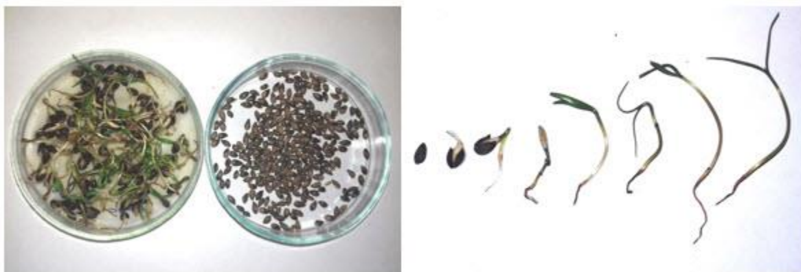
Figure 2. Seed germination in laboratory conditions of the form Biota orientalis f. compacta

Three days later, the seeds were opened and 0.3-0.4 mm processes appeared. It is known that water is a necessary external factor for seed germination. After five to six days, the seeds formed 2 cotyledon leaves 0.5-0.6 mm long and 0.2-0.3 mm wide, and the length of the process (hypocotyl) was 0.5-0.6 mm. Ten days later, two lanceolate leaves appeared, 1.5-2.3 cm long and 0.2-0.3 mm wide. The hypocotyl has a length of 3-4.1 cm, and its root is 0.8-1.3 cm. After fifteen days, the height of the hypocotyl was 6.2 cm, and the length of the leaf reached 3.2 cm (Figure 2).