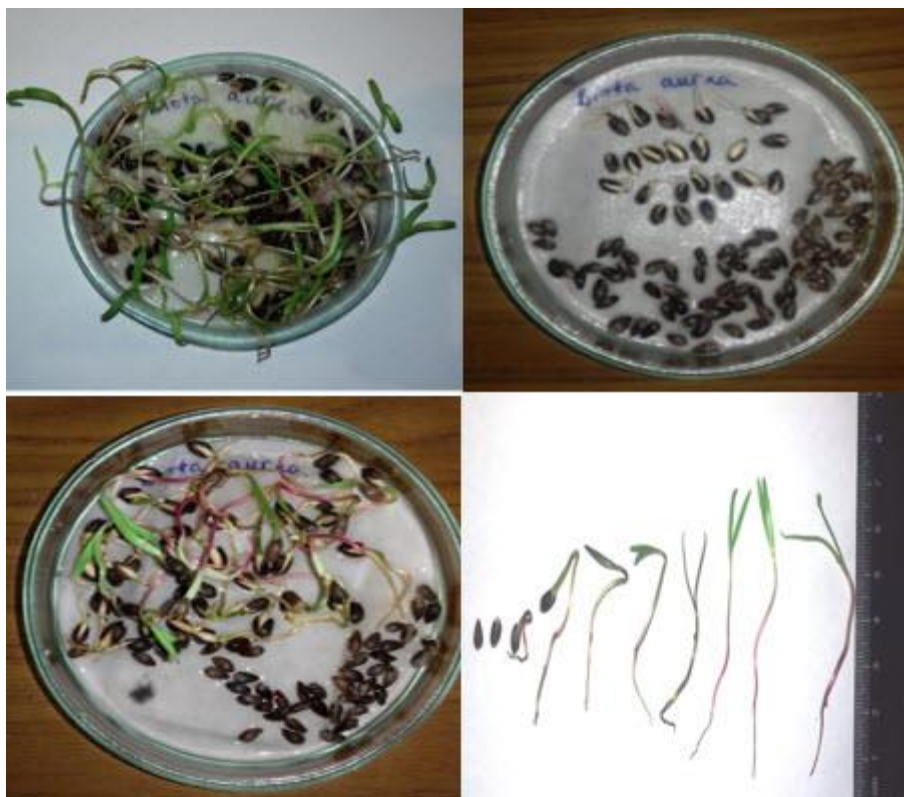
Figure 5. Germination of seeds of Biota aurea in the laboratory

After 15 days in the laboratory, 2 seedlings were formed. Their length is 1.5-2.5 cm, width 0.3-0.4 mm, length of the hypocotyl 3-5 cm, root 1-2.5 cm (Figure 5).