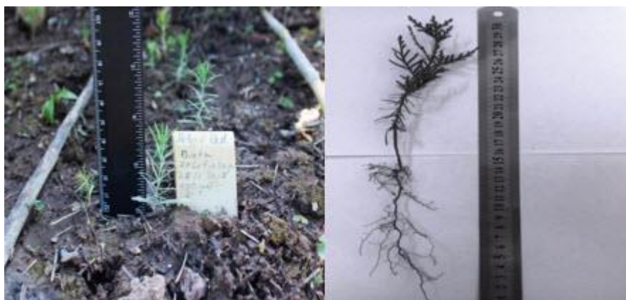
Figure 6. The first year of the growing season of the form of Biota aurea , propagated by seeds.

The average air temperature during this period was 30.6°C, the highest - 38.4°C and the lowest - 21.1°C. At the end of the growing season, no bud formation was observed. The buds began to appear from March of the following year. Plant growth begins with the division of the needles. It was noted that in annual plants the root part became 15-18 cm deeper and formed a large number of 2 nd and 3 rd order roots (Figure 6).